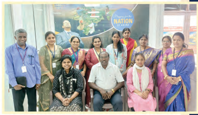
How can you participate?

Join us in this divine mission, and you will be blessed to be a blessing.